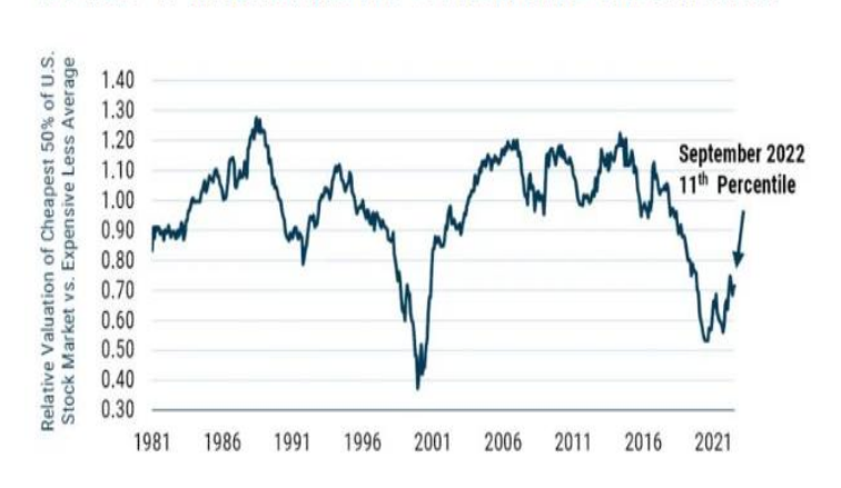
As of 9/30/2022 | Source: GMO Composite Valuation is composed of price/sales, price/gross profits, price/book, and price/economic book.